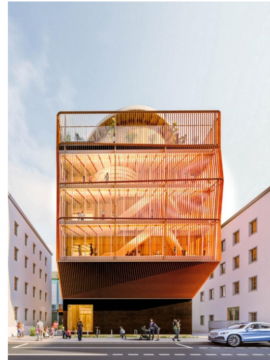
Figure 1: Kérés KITA 3D Model (TUM-Campus) [2]